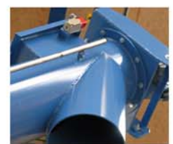
Inspection with switch.